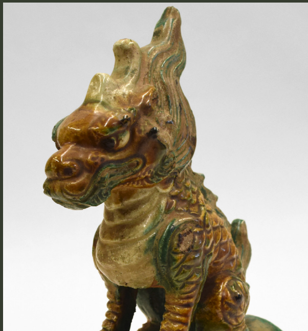
Chinese (c. 1850), Antefix (Quilin-form Roof Tile), glazed earthenware, 10¾ x 4½ x 7½ inches, Museum Purchase, 1929.216.1.

Celebrating the Year of the Dragon (2024), this exhibition explores the artistic theme of the dragon from the East to the West. Dragons and other mythical beasts have captured the imagination of artists and craftsmen for centuries, and historic narratives such as; Saint George and the Dragon; explore the dual nature of the fearsome yet revered creatures. In some cultures, dragons are a threatening symbol of evil, while in others, they are perceived as symbols of strength and wisdom. Drawn from The Museum's rich Permanent Collection, the exhibit complements The Lost World of Dragons , which runs concurrently. More than twenty works that feature dragon imagery including ceramics, ivory, sculpture, etchings, engravings, posters, and paintings from the seventeenth through the twentieth century will be on view.